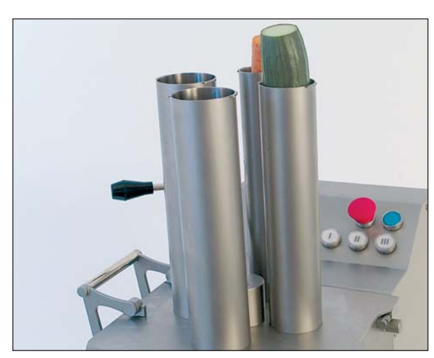
3. Tube feeder for small items of food in all standard sizes. Appliance with three speed settings.