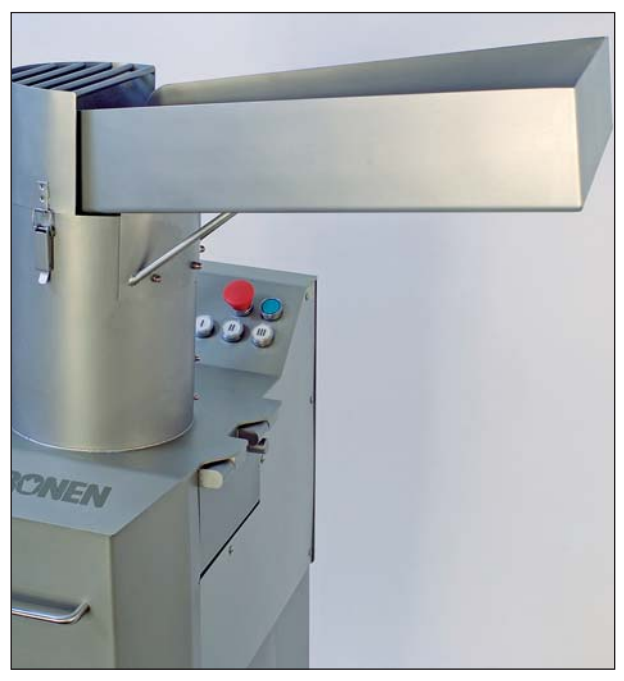
Funnel attachment - suitable for bulk goods like apples, nuts, almonds. No pressure required - no damage to food! Safety device included.