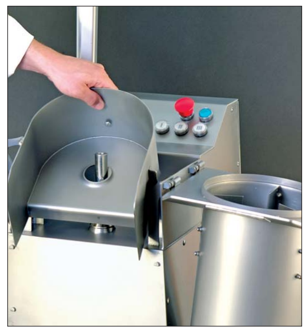
The blade compartment is easily detachable - a feature you only find with Kronen appliances. How else would you be able to clean the machine properly?