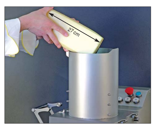
Whether you want to process a standard block of cheese of 27cm or a whole cabbage - you don't need to cut it up first. Comes with a choice of three feeding containers: 1. Feeding cylinder for big volume (see picture) 2. Cabbage/salad feeder with dividing blade.