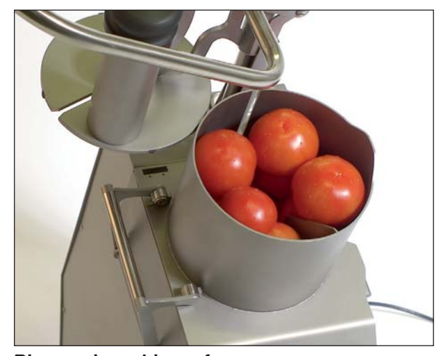
Big opening = big performance for large quantities of tomatoes, whole heads of lettuce, big pieces of cabbage or blocks of cheese. Tasks finished in no time at all!